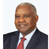
By Byron Shoulton